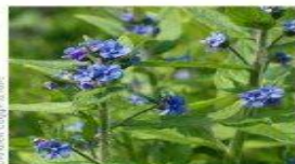
Green alkanet Pentaglottis sempervirens

Little blue/purple flowers and reddish stems and leaves, often found on walls.