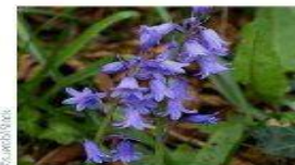
Spanish bluebell Hyacinthoides hispanica

Up to 2m tall with distinctive egg-shaped flowers and long spines