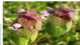
Red dead-nettle Lamium purpureum

A large plant up to 2m tall growing in clumps. Pink/purple flowers are followed by fluffy seeds. Also known as 'Fireweed' as it colonises sites after fire.