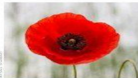
Common poppy Papaver rhoeas

Annual with striking red flowers found where soil has been disturbed, so often seen on waste ground and roadsides.