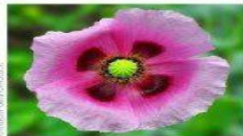
Opium poppy Papaver somniferum

Annual with striking red flowers found where soil has been disturbed, so often seen on waste ground and roadsides.