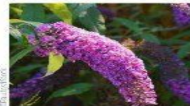
Butterfly-bush Buddleja davidii

A common garden flower seen in a wide variety of bright colours, often found on pavements and walls. Squeeze the flowers to open their mouths.