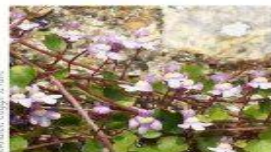
Ivy-leaved toadflax Cymbalaria muralis

Has tufts of narrow bluish-green leaves and long spikes crowded with tiny purple flowers. Often grows on walls, pavements and wasteground.