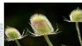
Wild teasel Dipsacus fullonum

A large perennial to 1m with rough leaves and pretty blue forget-me-not type flowers.