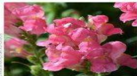
Snapdragon Antirrhinum majus

Dead-nettle's pink-purple flowers cluster amongst hairy, heart-shaped leaves towards the top of the plant and can bloom from February to November.