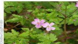
Herb robert Geranium robertianum

Annual with large, blue-green leaves and large pink or lilac flowers. Edible poppy seeds come from this plant.