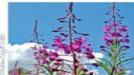
Rosebay willowherb Chamerion angustifolium

Pink flowers 2cm across. Hairy leaves with a triangular outline are sometimes reddish and produce a strong, unpleasant smell.