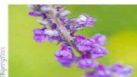
Purple toadflax Linaria purpurea

A large bush with long spikes of scented purple flowers, very attractive to butterflies. Common on wasteground, walls and railways.