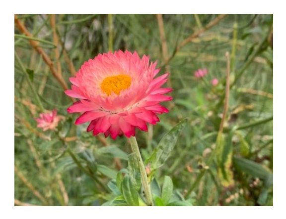
Read more about winter colour