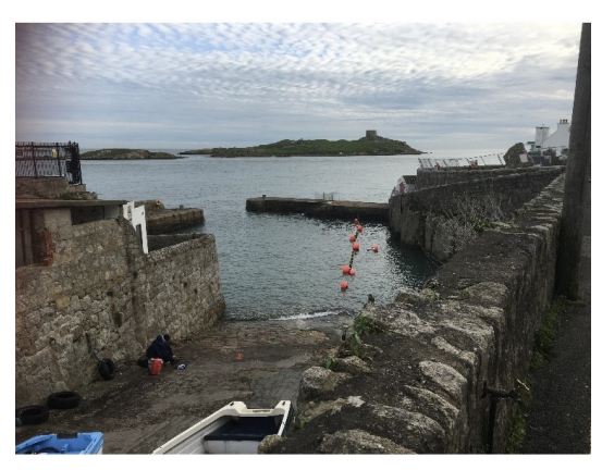
Take a look at our website for more ideas