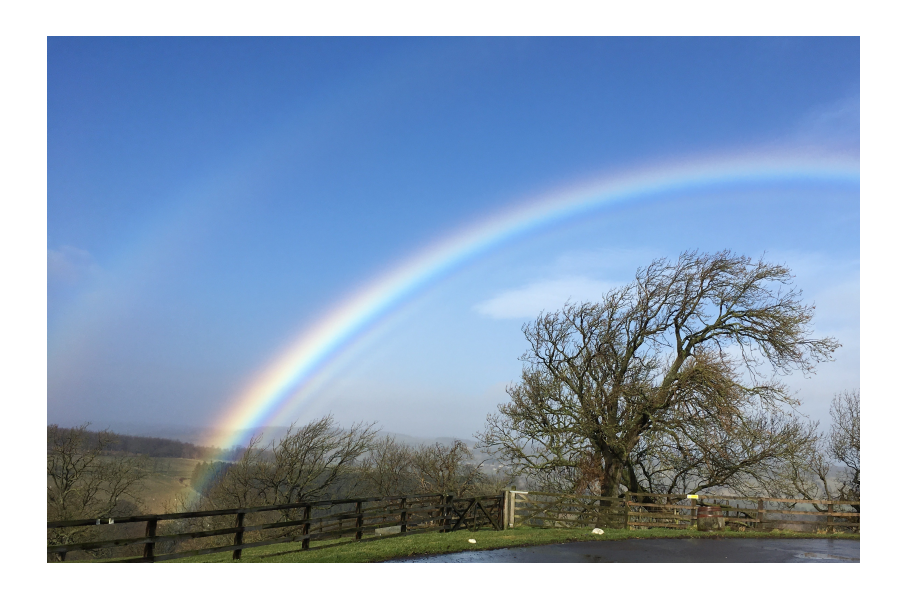
Watch the video about rainbows

There's a lovely video from the Met Office showing unusual rainbows.