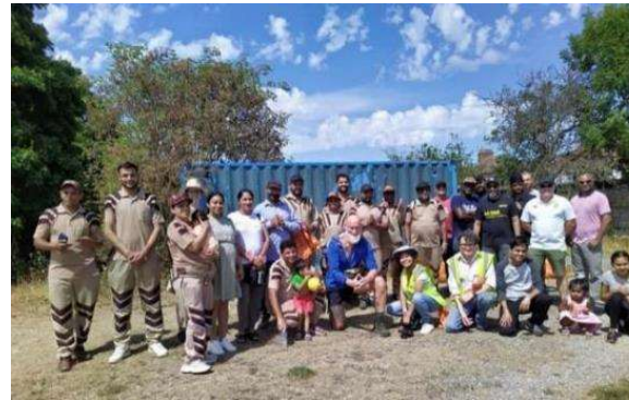
Cranford Action group at Waye Avenue Open Space