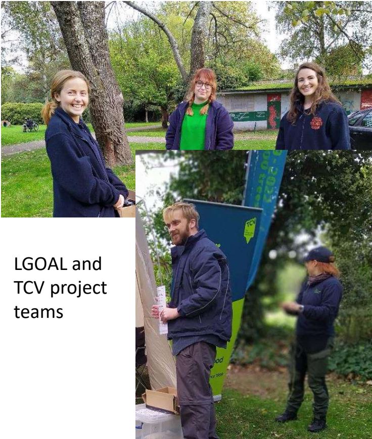
LGOAL and TCV project teams