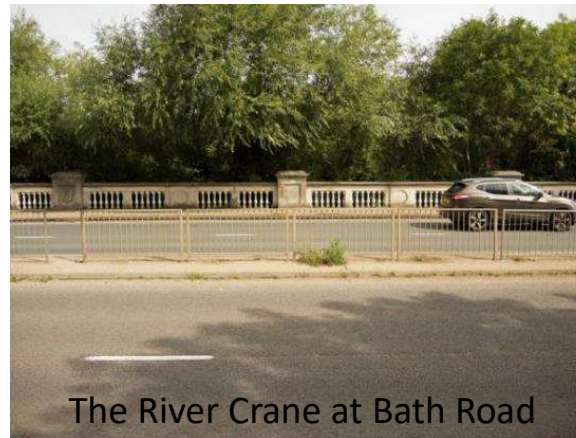
The River Crane at Bath Road

The River Crane at Waye Avenue Open Space and Avenue Park. Many people don't know that it is there!