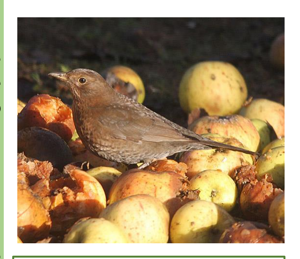
Don't throw out wrinkly old fruit, birds like starlings will enjoy them.

If you feed birds it is worth considering putting out food in different places in the garden or patio to reduce competition between birds. This way more birds can feed at any one time.